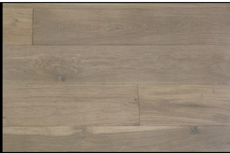
Wirebrushed Oak Urban Grey