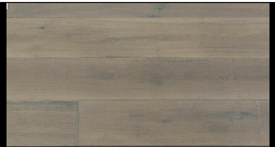
Wirebrushed Oak Driftwood