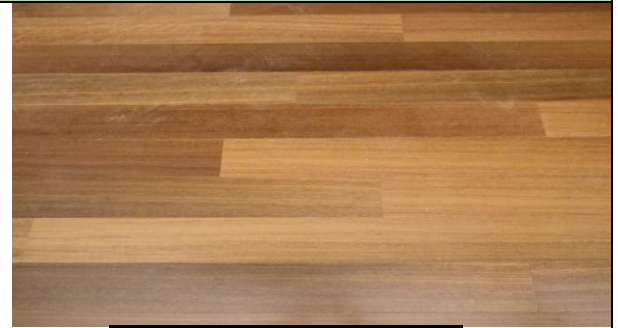
Select Spotted Gum HM Walk

LOCKING SYSTEM - Valinge glueless joining system