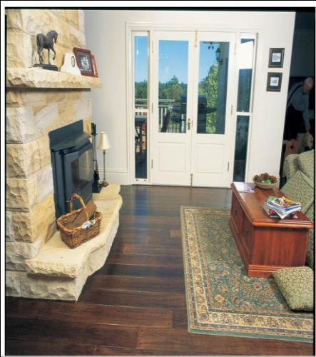
OLD WORLD HANDCRAFTED FLOOR