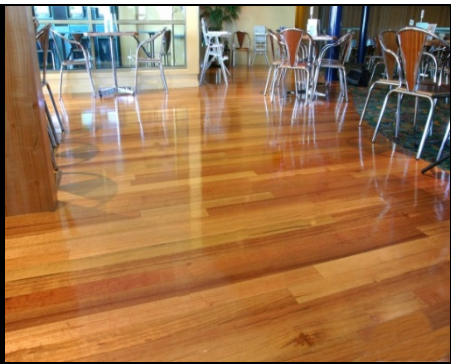
Select Grade Australian Chestnut Flooring