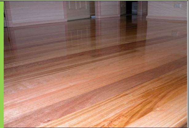
AUSTRALIAN CHESTNUT FLOORING