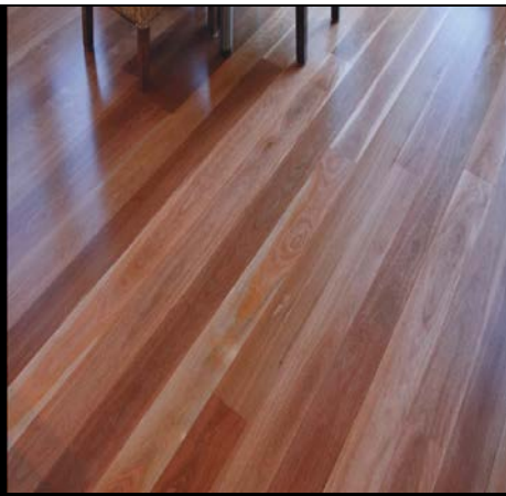
Turpentine Select Flooring