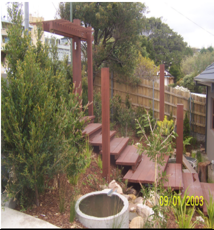
IRONBARK ROUGH SAWN GREEN OFF SAW