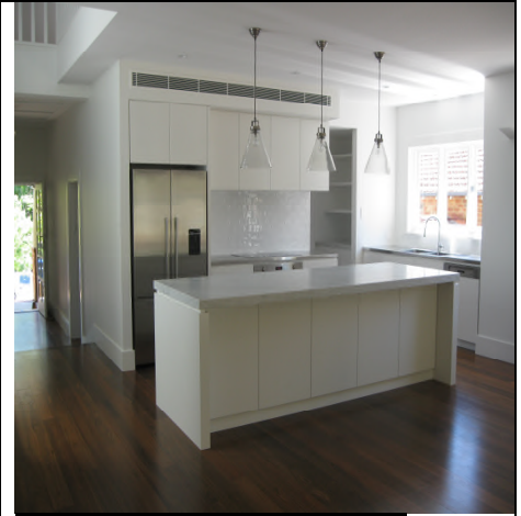
Roasted Caramel 128mm x14mm flooring