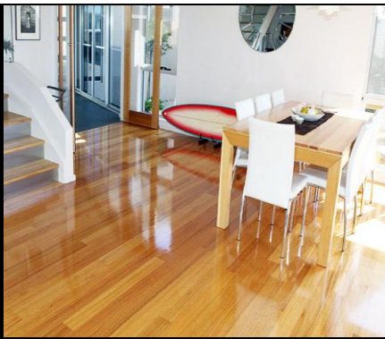
Select Grade Tasmanian Oak Flooring