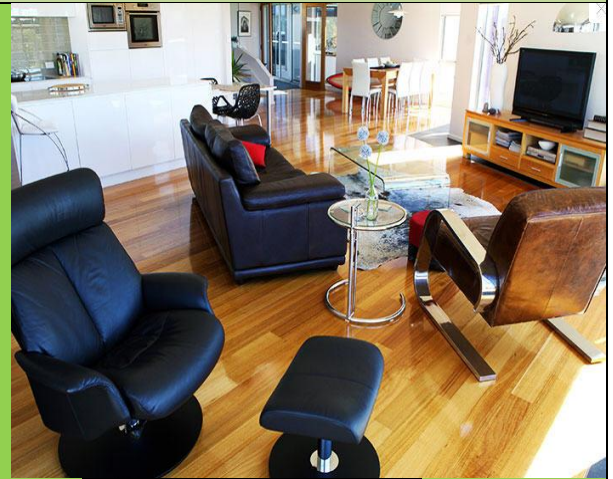
TASMANIAN OAK FLOORING