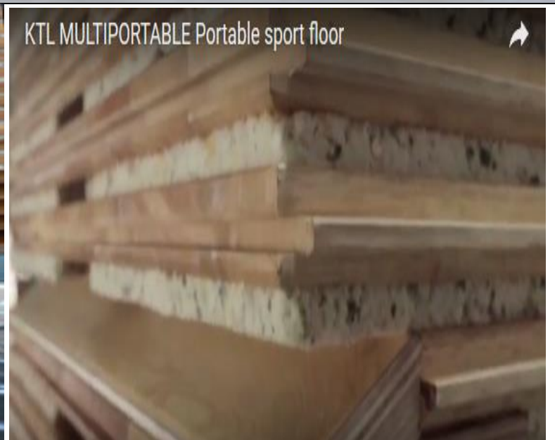
KTL MULTIPORTABLE Portable sport floor