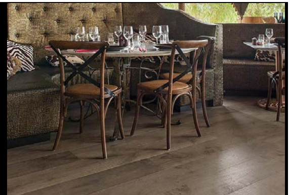
French Grey French Oak Flooring