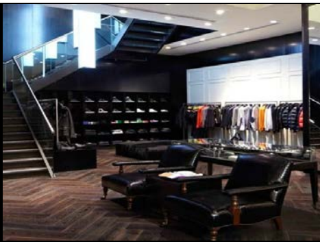
Handcrafted French Oak Parquetry