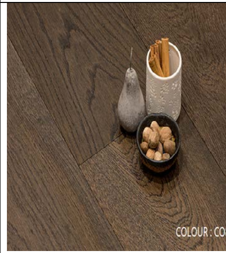
COLOUR : C08