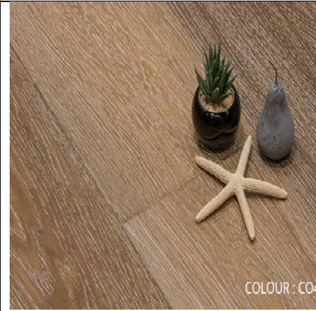
COLOUR : C04