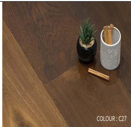
COLOUR : C27