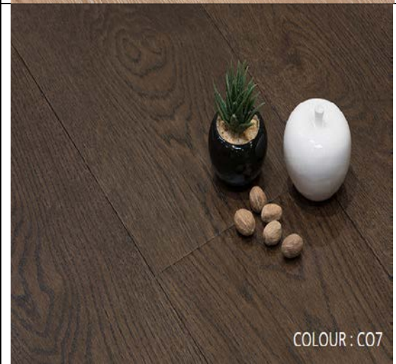
COLOUR : C07