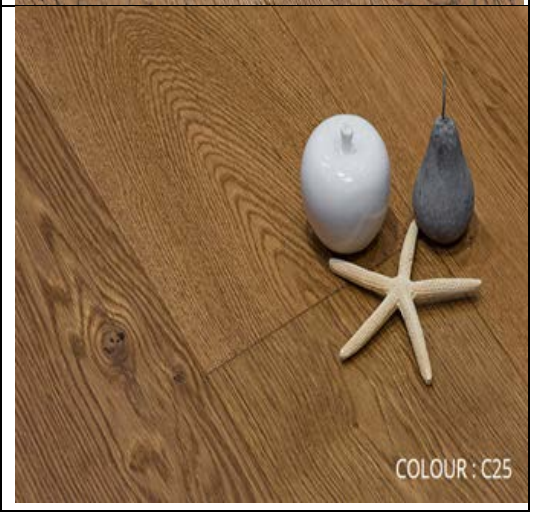
COLOUR : C25