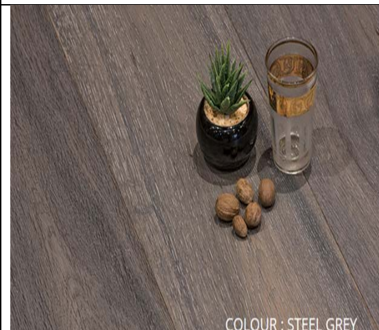
COLOUR : STEEL GREY