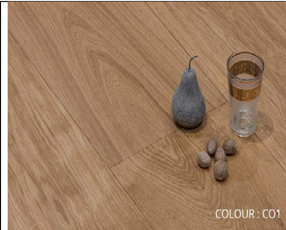
COLOUR : C01