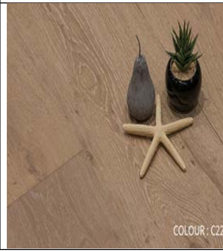
COLOUR : C22