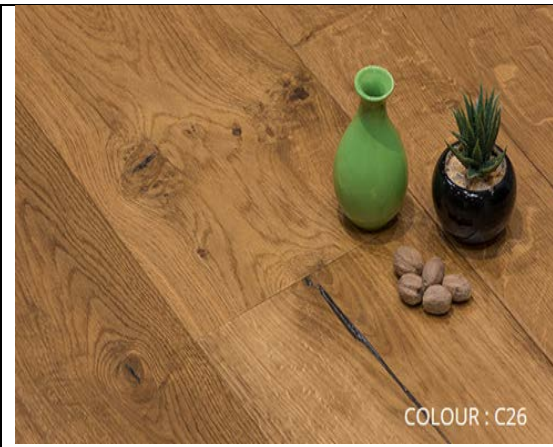
COLOUR : C26