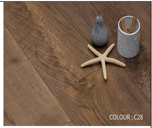
COLOUR : C28