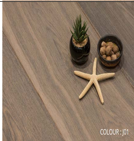
COLOUR : J01