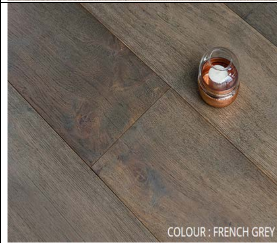
COLOUR : FRENCH GREY