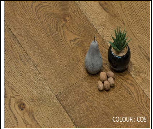
COLOUR : C05