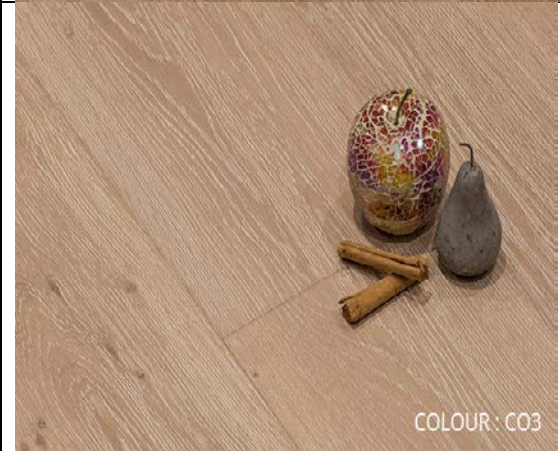
COLOUR : C03