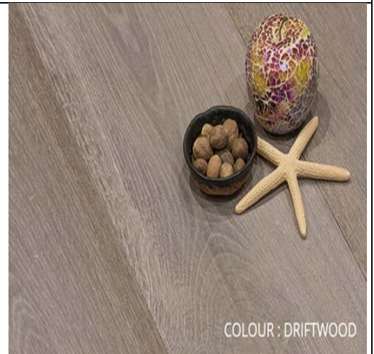
COLOUR : DRIFTWOOD