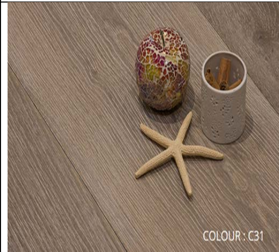
COLOUR : C31