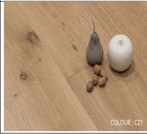
COLOUR : C21