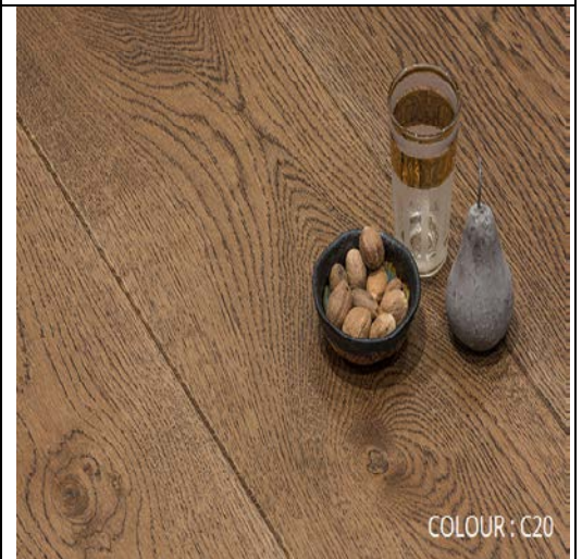
COLOUR : C20