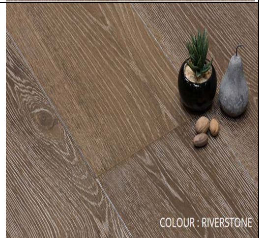
COLOUR : RIVERSTONE