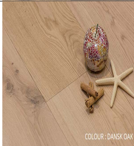
COLOUR : DANSK OAK