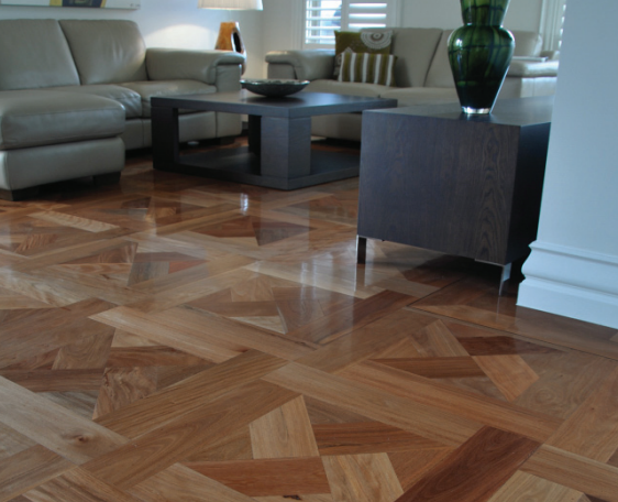
SELECT BRUSHBOX PARQUETRY