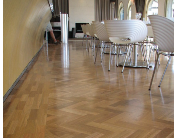
SELECT SPOTTED GUM PARQUETRY FLOOR