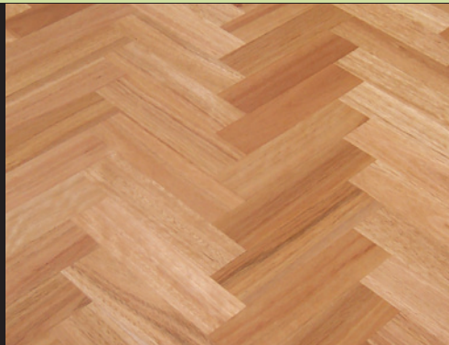
SELECT BLACKBUTT PARQUETRY