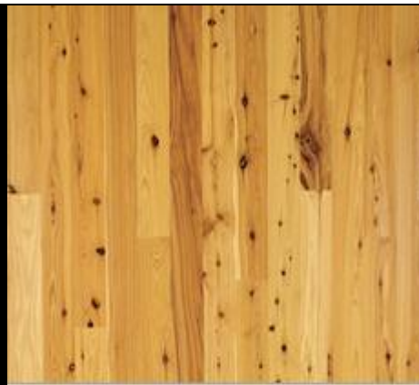
Select Grade Cypress Pine Flooring