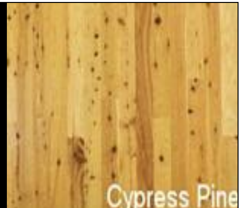
Cypress Pine Flooring