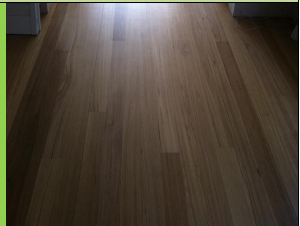
SOUTHERN BEECH FLOORING