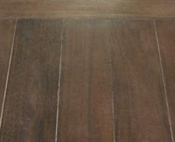
STAINED BLACKBUTT FLOORING