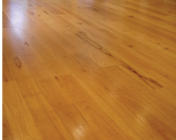
RUSTIC BLACKBUTT FLOORING 180 x 21