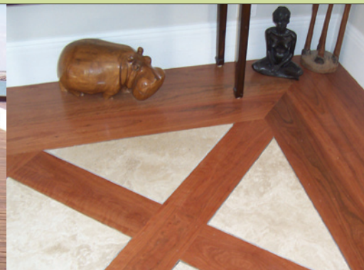
RED IRONBARK FLOORING