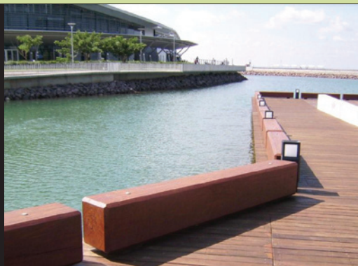
RED IRONBARK BEAMS AND DECKING

APPLICATION – Flooring, parquetry, decking, Staircase Material structural, & lining