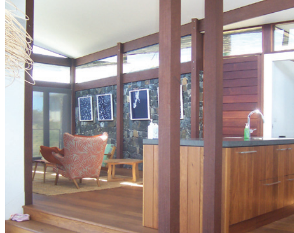
RED IRONBARK BEAMS