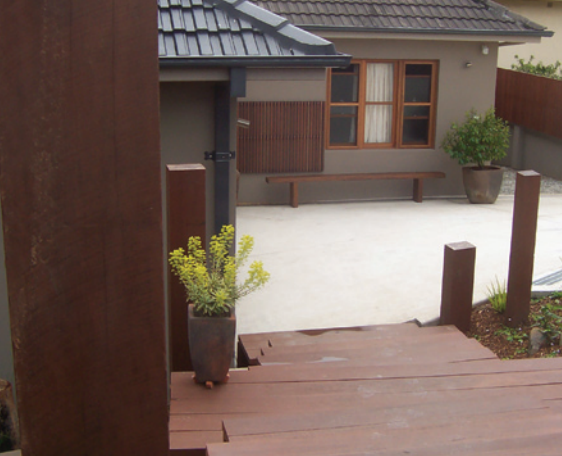
RED IRONBARK BEAMS & BATTENS