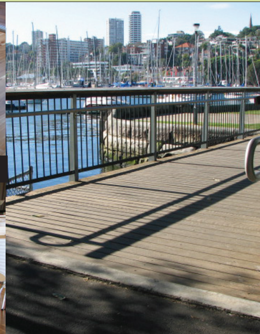
SPOTTED GUM DECKING