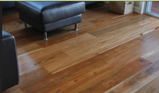
RUSTIC SPOTTED GUM FLOORING

APPLICATION - Flooring, parquetry, decking, staircase material, lining & weatherboard.