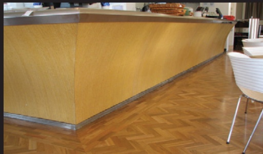
SPOTTED GUM PARQUETRY