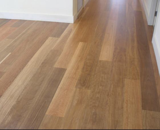
SELECT SPOTTED GUM FLOOR 180 X 14