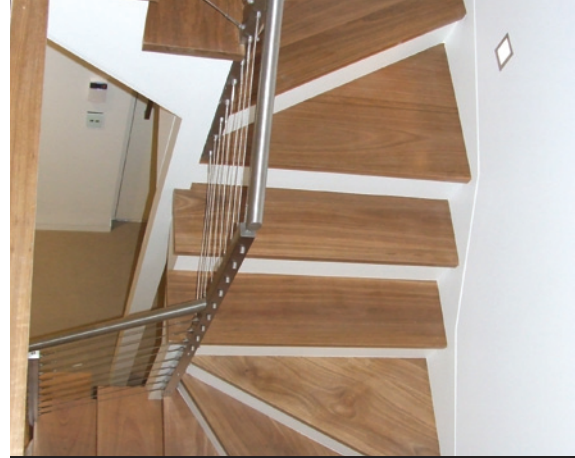
SELECT SPOTTED GUM STAIRCASE