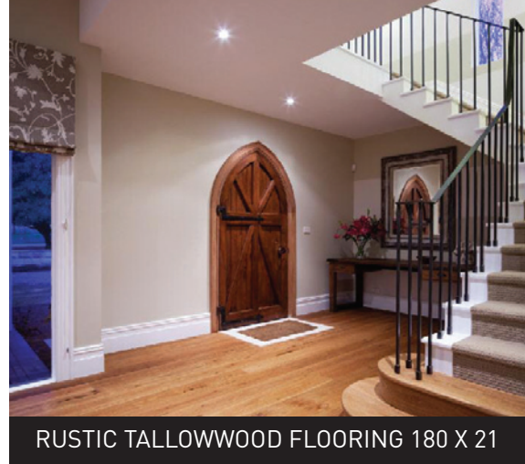
RUSTIC TALLOWWOOD FLOORING 180 X 21