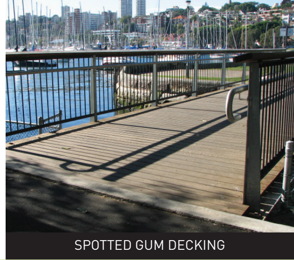
SPOTTED GUM DECKING