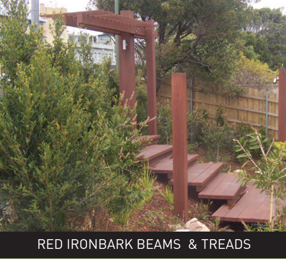
RED IRONBARK BEAMS & TREADS