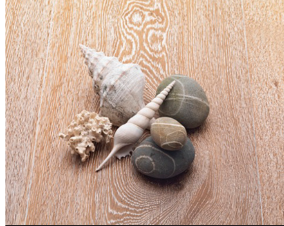
LIME PRE ENGINEERED AWO FLOORING