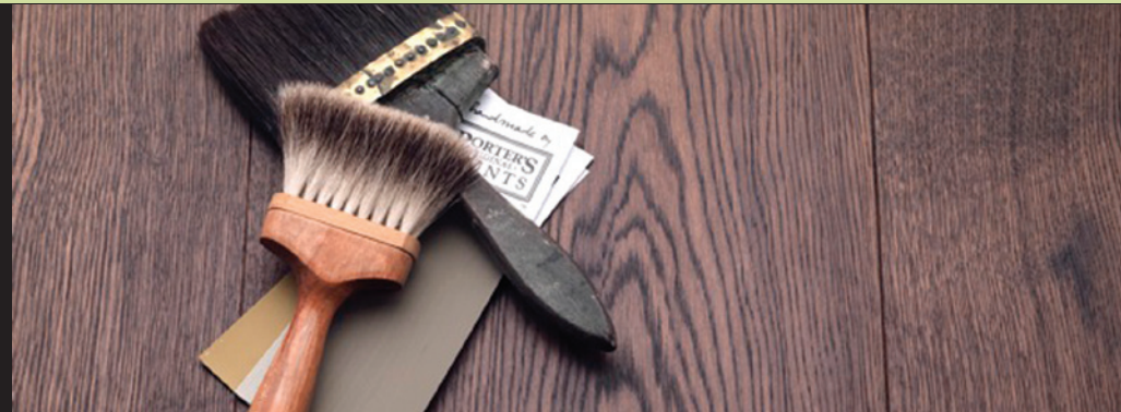
TURKISH COFFEE PRE ENGINEERED AWO FLOORING