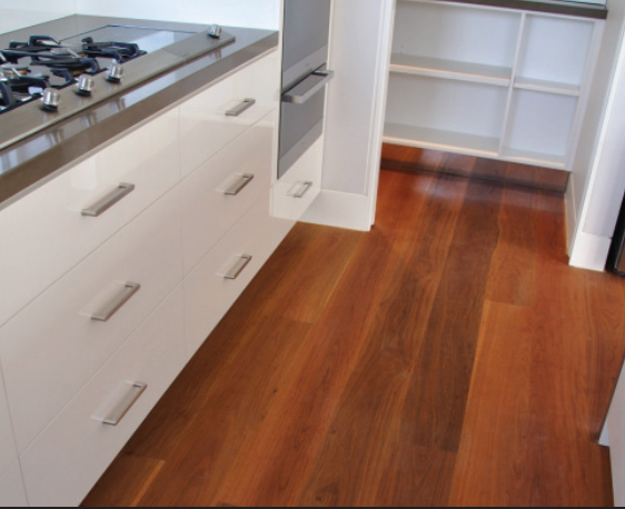
SELECT GREY IRONBARK FLOOR 180 X 21