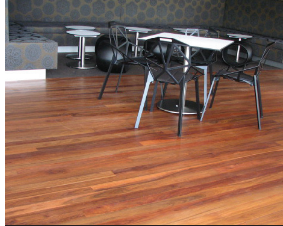
STANDARD & BETTER GREY IRONBARK