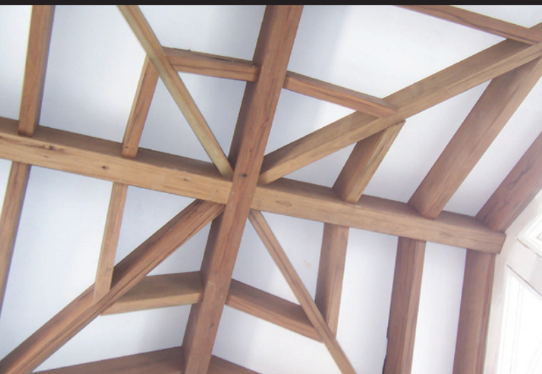
RECYCLED BEAMS IN NASH OFFICE