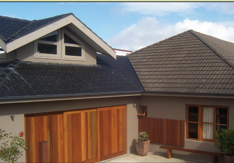
RECYCLED GARAGE DOOR & BENCH AT NASH OFFICE