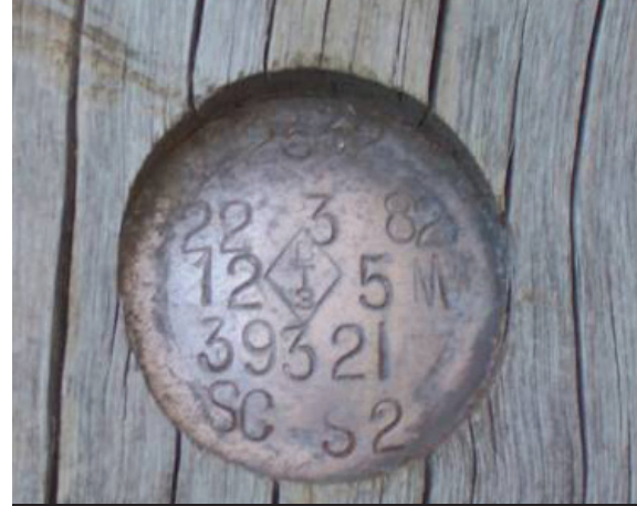
IDENTIFICATION TAG ON POWER POLE