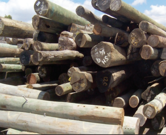
RECYCLED POWER POLES