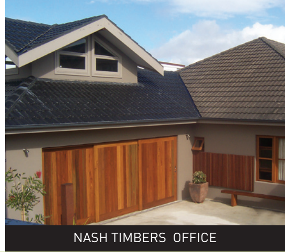
NASH TIMBERS OFFICE