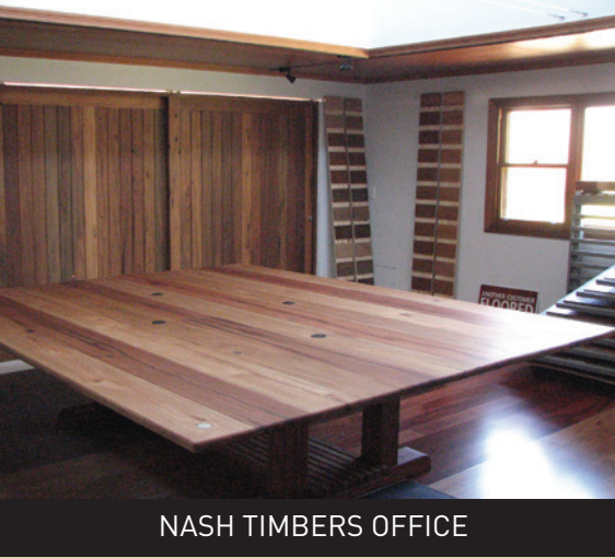
NASH TIMBERS OFFICE