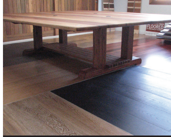
NASH TIMBERS OFFICE