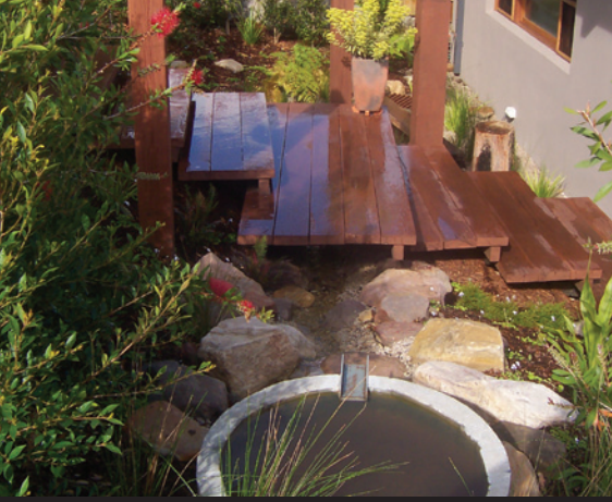
NASH TIMBERS OFFICE